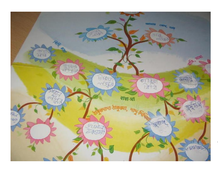
A family tree of a child

"To develop a community based initiative towards creating an enabling environment for people infected and affected by HIV and AIDS with a special emphasis on safeguarding future plans of children."