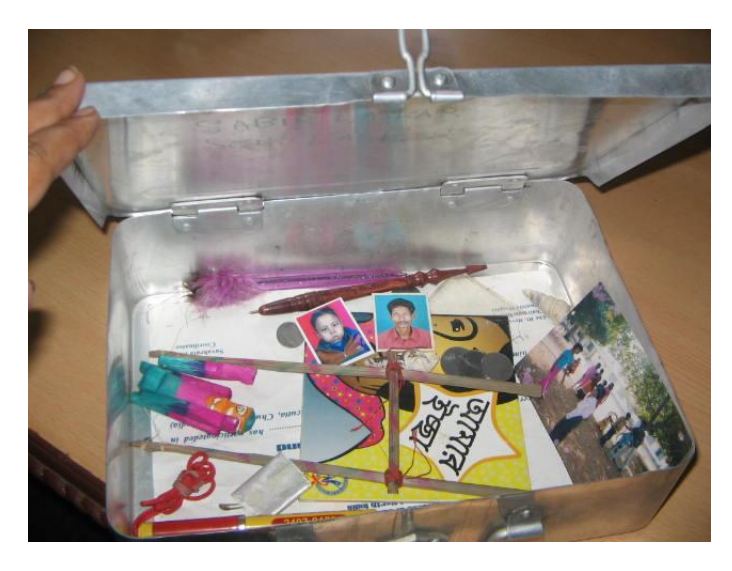
A memory box of a child with his valuables