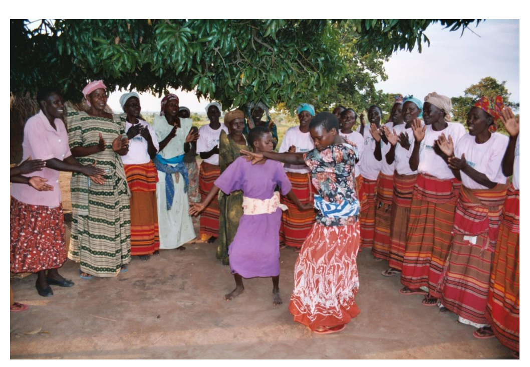
The music of love, the music of power within