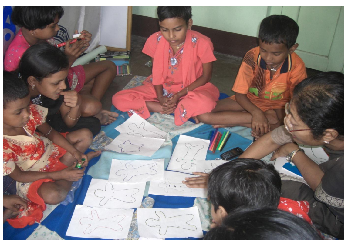
A child session on bad touches and good touches

Sessions were run separately for children within 5 -10 year and 10 -18 year groups. For the younger children, sessions were mostly conducted through joyful learning such as creative games, poetry, drama, paintings, rhymes, audio-visual sessions, dance, and songs. The primary aim was to help them communicate and strengthen their relations with others. They would understand how the body functions, what the key components are including the sexual organs, and how disease occurs and one falls ill. These would lay the foundation for introducing HIV and AIDS, explained as a virus affecting the